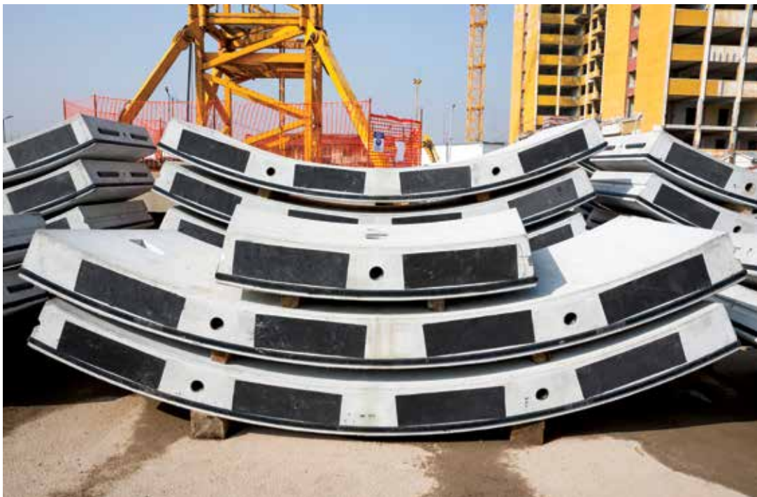
Figure 3. Structural design of concrete segments used for tunnels continues to improve, making the segments more durable and corrosion-resistant.

Excavation equipment must use pressurized-face tunneling equipment to control the earth and groundwater pressure that continually acts on the tunnel