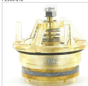
Febco PVB Bonnet/Poppet Kit 1" - 1-1/4" | FE905-212

If you follow one of these processes, you will greatly reduce the risk of your "bonnet/poppet" freezing. If it does freeze, the replacement parts are only about $20-$35 to purchase. They are actually relatively easy to replace and you can save yourself the typical $300 + repair by doing it yourself. ~Jeff Baker