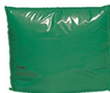
Dekorrra Green Insulation Pouch 24" x 16" | 609-GN

Sale Price: $43.48 Regular Price: $86.80