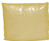
Dekorrra Desert Tan Insulation Pouch 24" x 16" | 609-DT

Sale Price: $43.48 Regular Price: $86.80